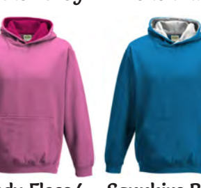
Sapphire Blue/ Candu Floss/ Heather Grey Hot Pink